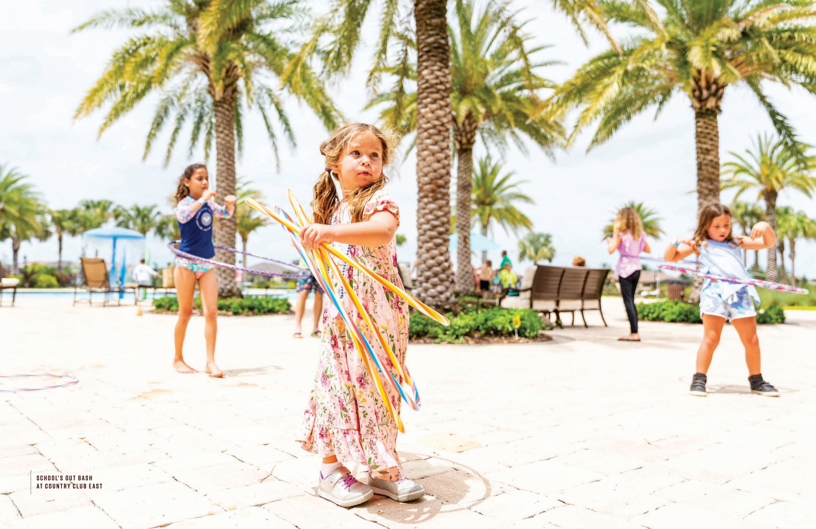
SCHOOL'S OUT BASH AT COUNTRY CLUB EAST