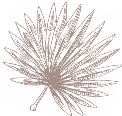
APPROXIMATELY 40% OF THE RANCH'S TOTAL ACREAGE IS OPEN SPACE AND RECREATION