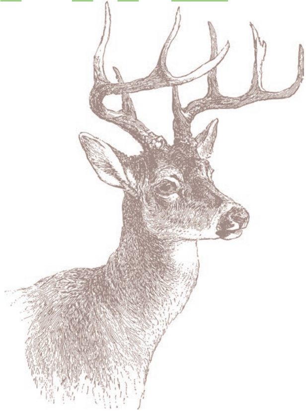
14,000 ACRES CERTIFIED "GREEN" BY THE FLORIDA GREEN BUILDING COALITION

One thing generations of ranching have passed down is a deep respect for the land. This is our common ground. So as we have developed, we have also been mindful to reciprocate. The Lakewood Ranch Community Development and Stewardship districts manage and protect the area's natural resources, and provide residents access to carefully planned parks, trails and community open space.