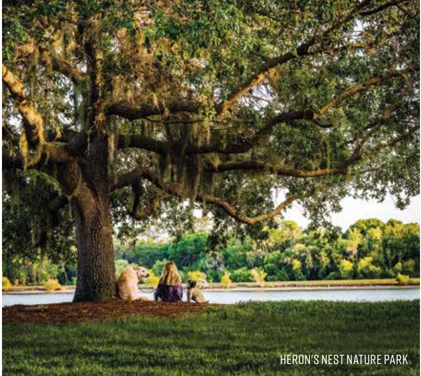
HERON'S NEST NATURE PARK