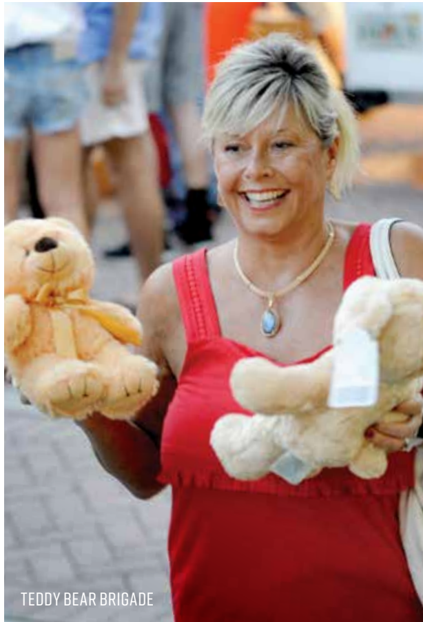
TEDDY BEAR BRIGADE