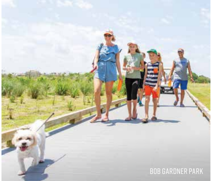
BOB GARDNER PARK