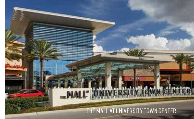
THE MALL AT UNIVERSITY TOWN CENTER