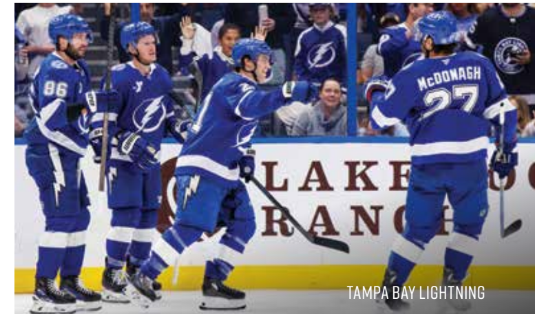
TAMPA BAY LIGHTNING