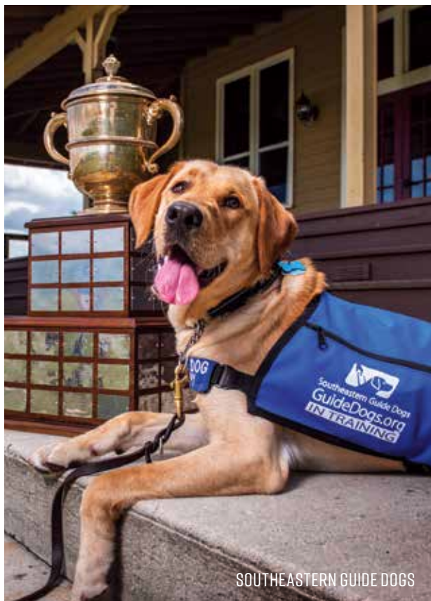
SOUTHEASTERN GUIDE DOGS