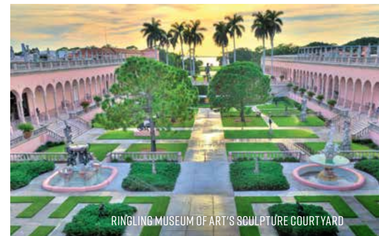
RINGLING MUSEUM OF ART'S SCULPTURE COURTYARD