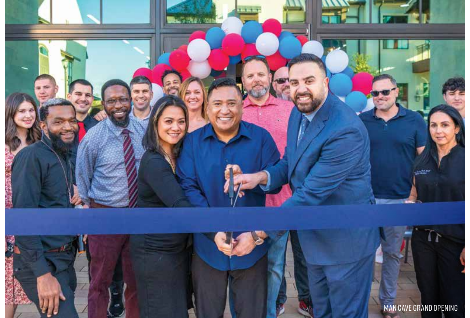
MAN CAVE GRAND OPENING